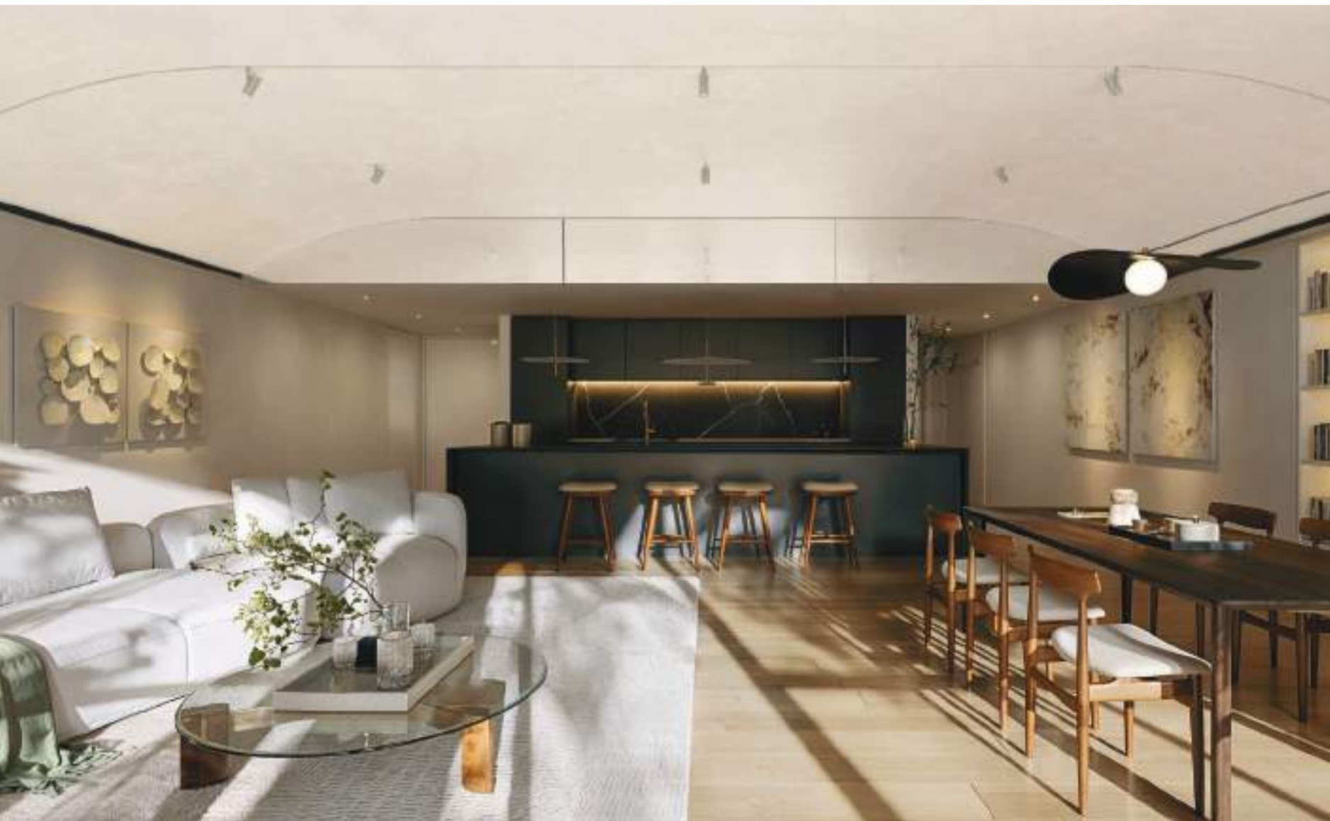
Spacious and functionally laid out kitchens in hardwearing and high quality finishes.