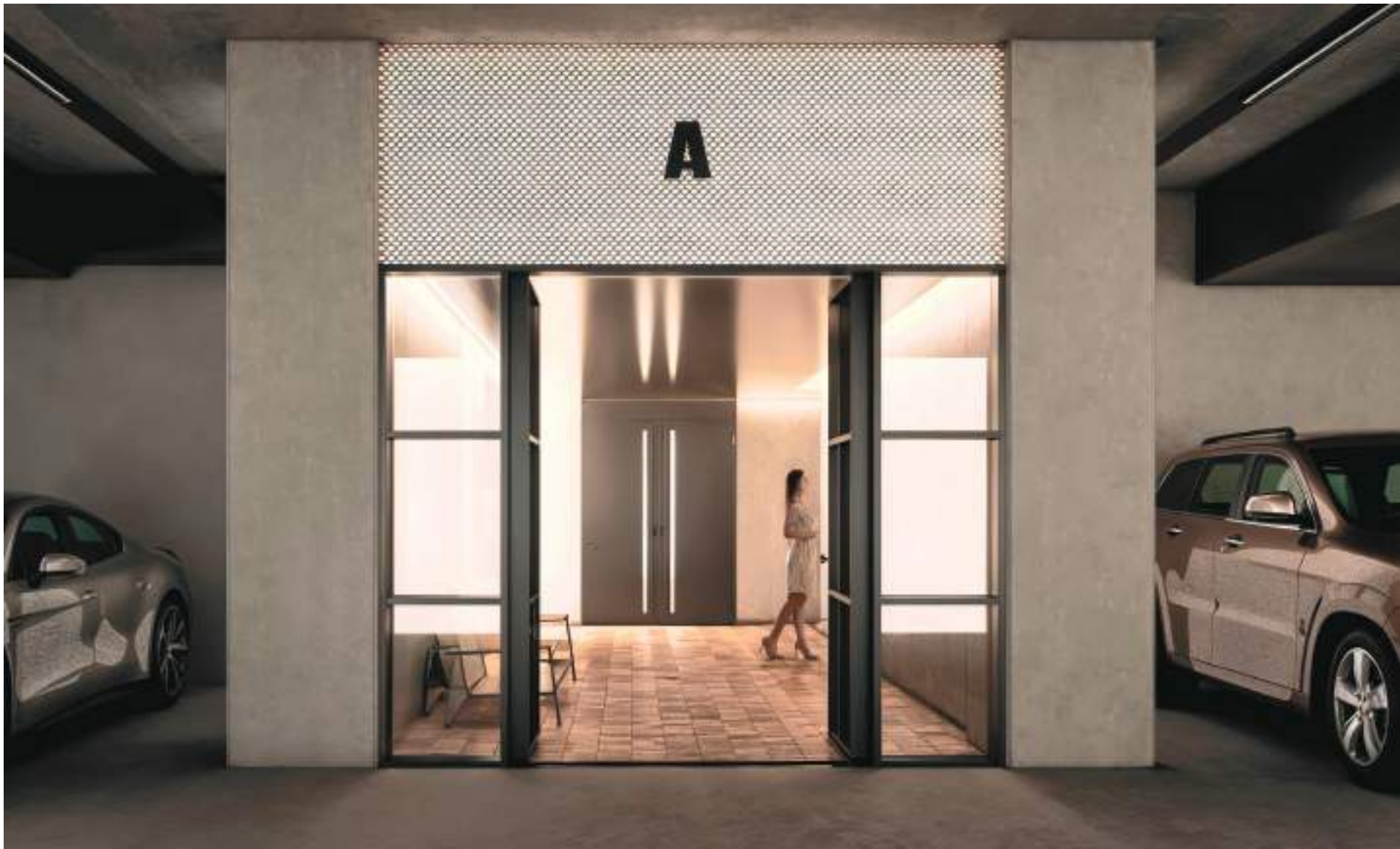
Seamless arrival, from parking to home.