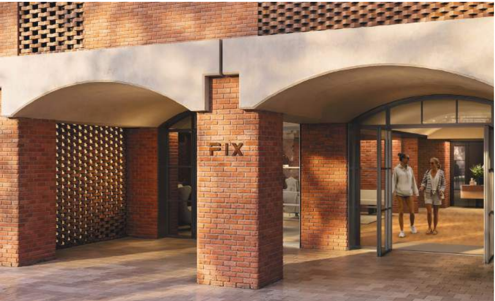
Main lobby entrance.