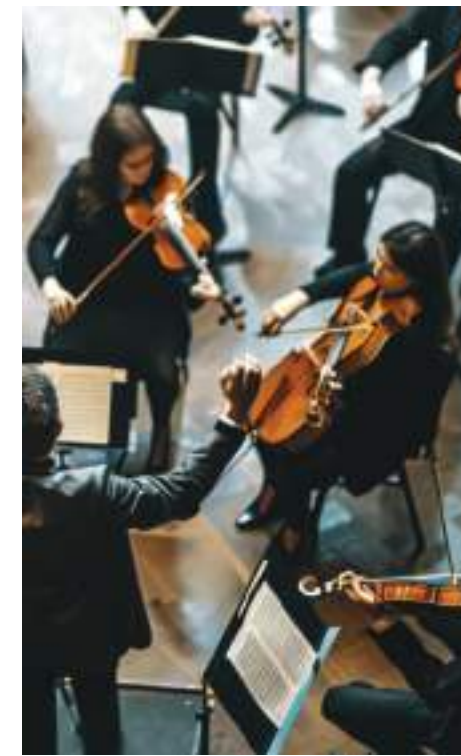
THE RETREAT 2