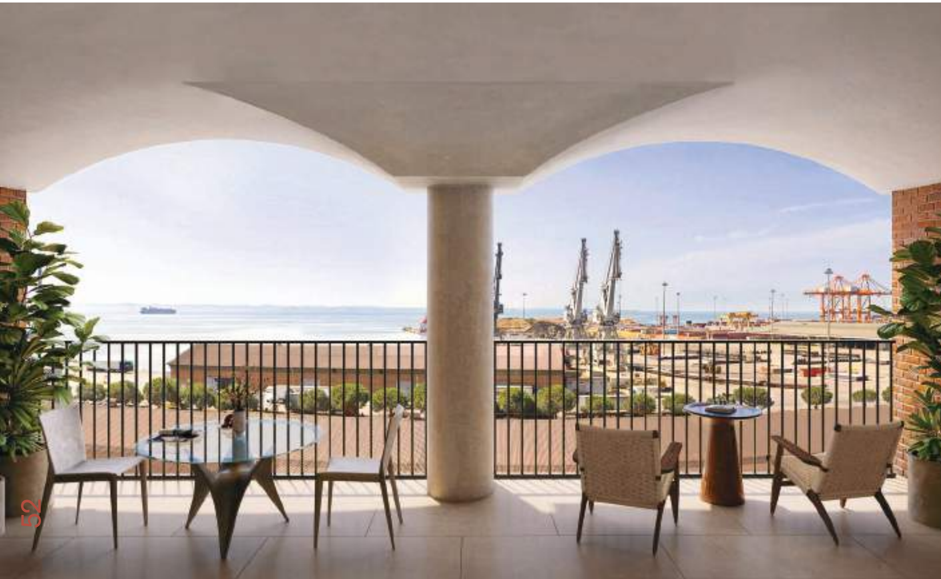
Spacious, private, and lush balconies offering a serene connection to the outdoors.