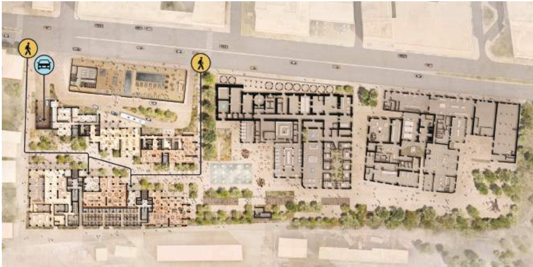
Convenient access by car or on foot.

Two underground car park levels, with a dedicated secure level for residents offering controlled access, one to two spaces per home, and monitored guest parking.