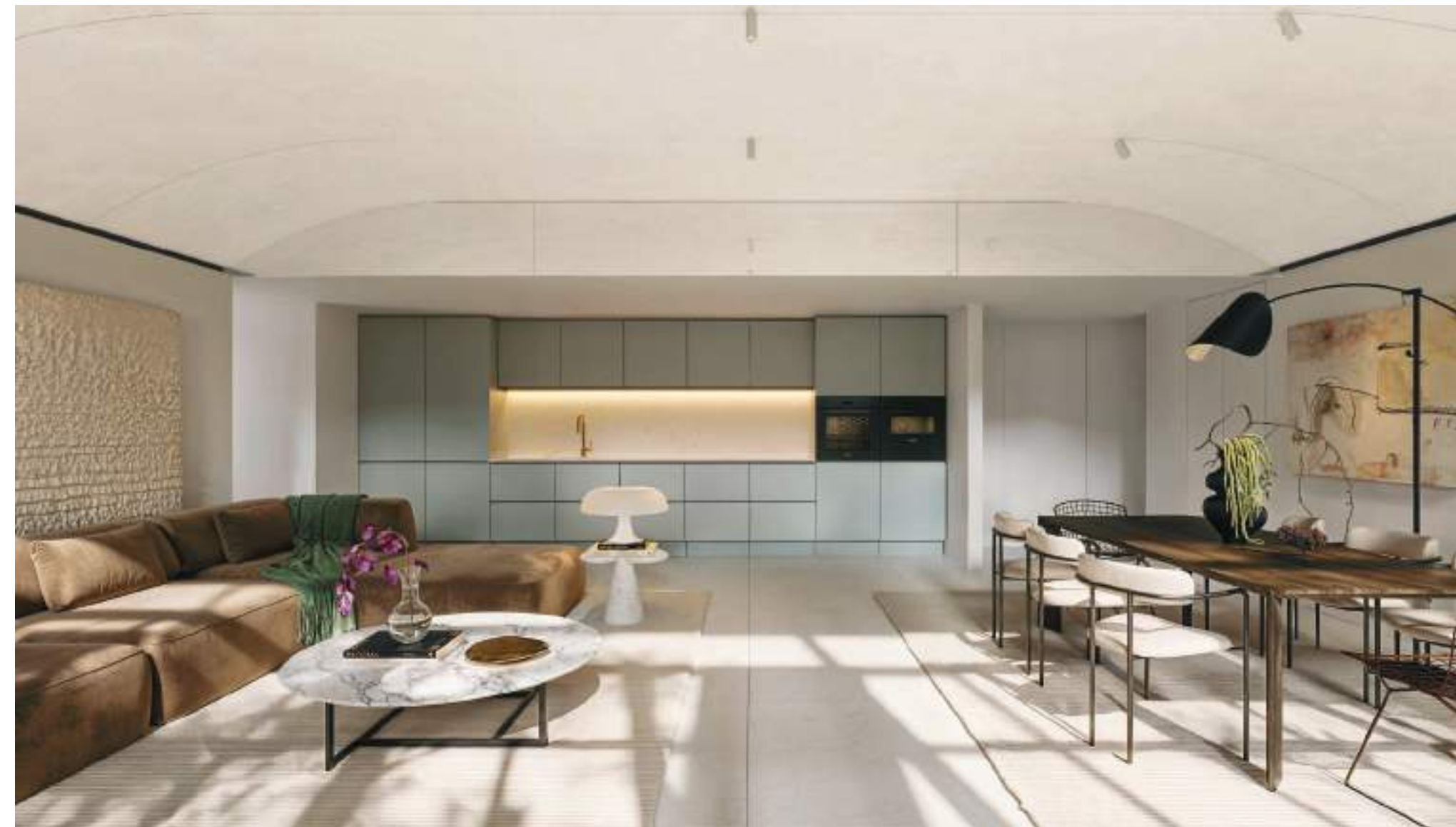
Connected Integrated Kitchen to Living and Dining Spaces.