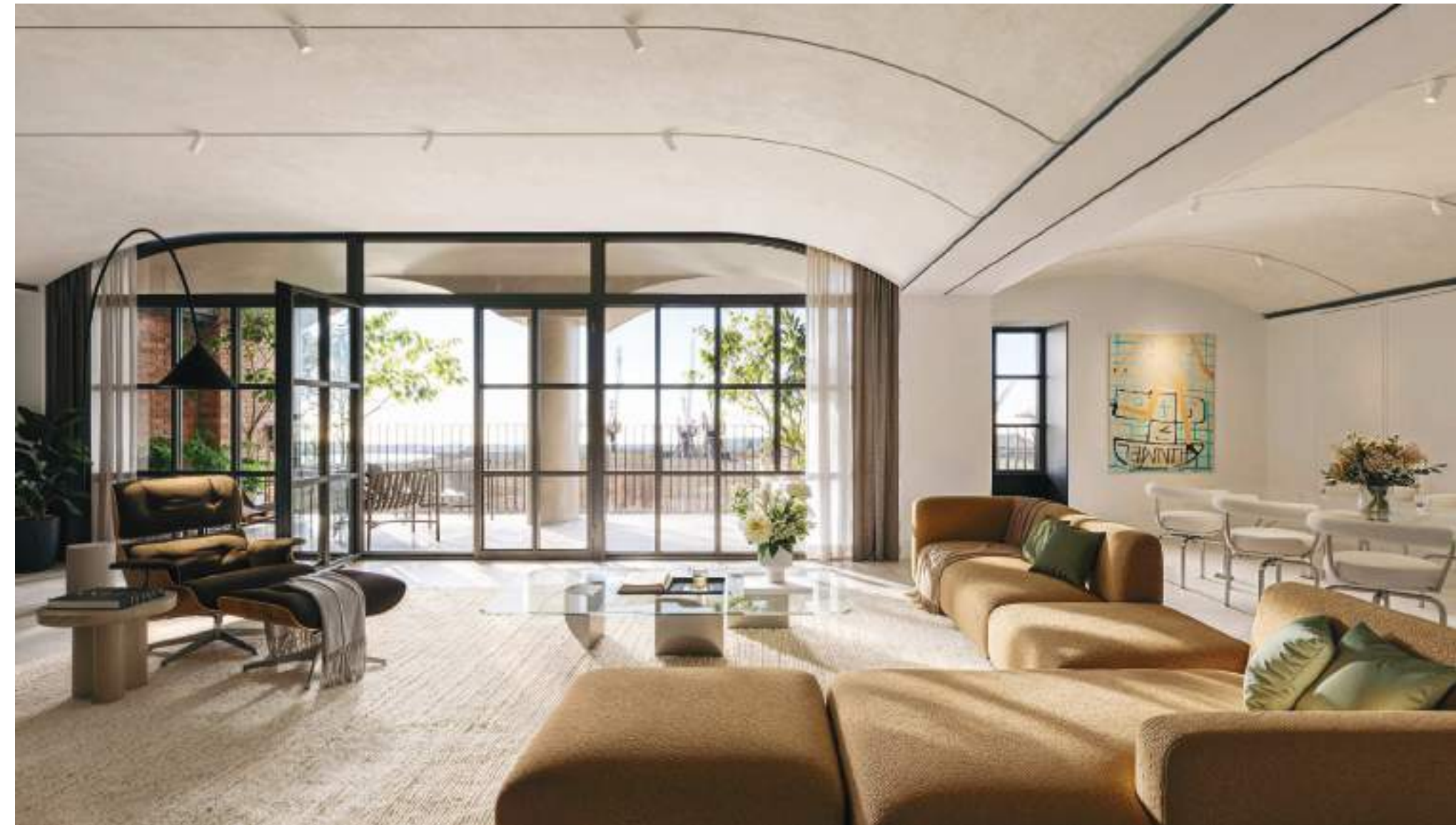
Every home features underfloor heating, comfort cooling, and advanced mechanical ventilation for year-round comfort.